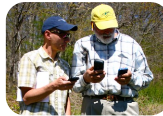
Geospatial Tools & Training