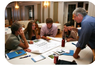
STEM Education & Local Conservation