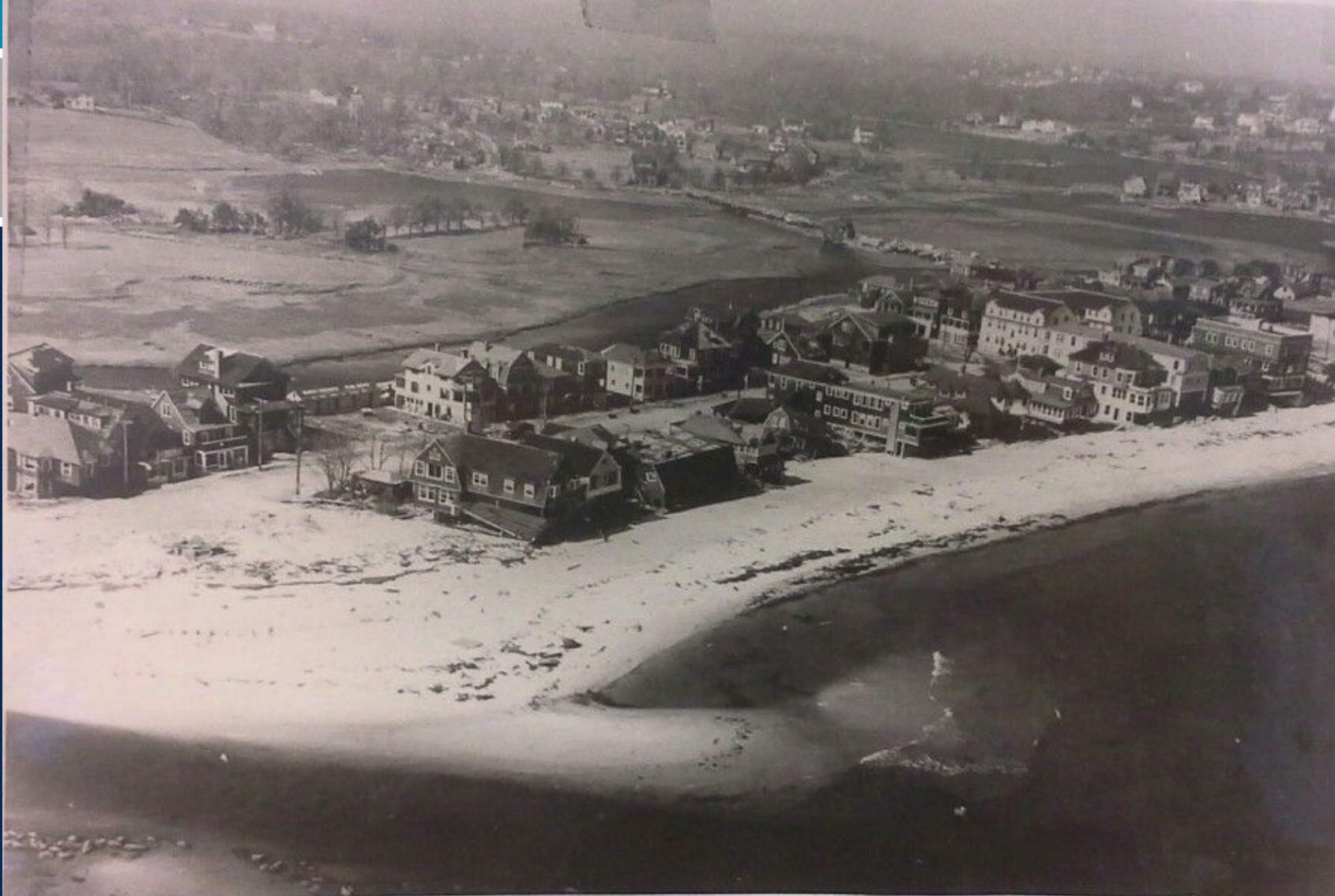
Hurricane September 21, 1938 Ocean Beach (west end) Alewife Cove (In background)