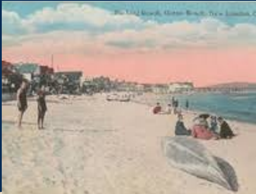
General View of Ocean Beach, New London, Conn.