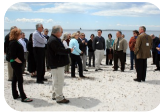
Land Use & Climate Resiliency