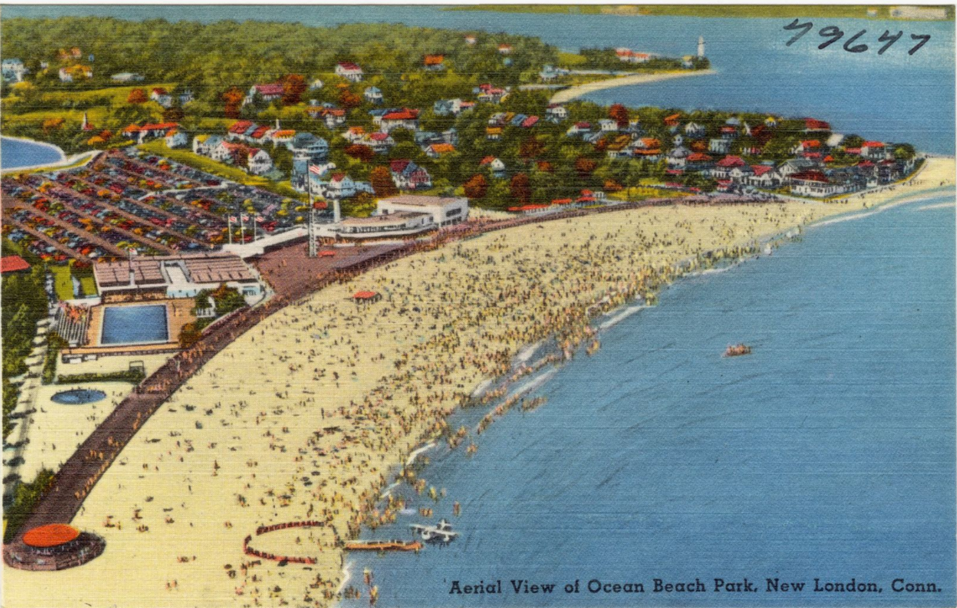
Aerial View of Ocean Beach Park, New London, Conn.